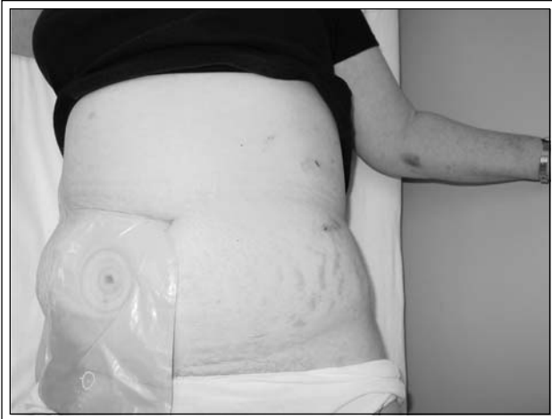
Figure 2. Post-operative result (2 weeks).

with 150 cc of blood loss. The total operative time was 2.5 hours.