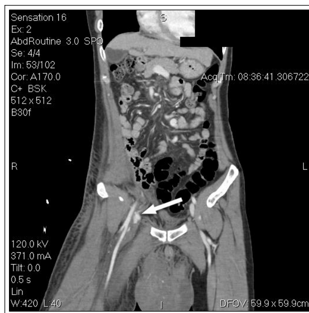
Figure 2. Computed tomography illustrating the right retroperitoneal bleed with a large scrotal hematoma. Extravasation of contrast can be seen from the origin of the inferior epigastric artery from the right femoral artery at the level of the inguinal ligament (arrow).

computed tomography (CT) scan was obtained, and the results revealed a large retroperitoneal hematoma extending into the scrotum with extravasation of the contrast medium from the right inferior epigastric artery, Figure 2. The patient was emergently taken to the operating room for groin exploration. An incision was made at the level of the inguinal ligament and further dissection enabled identification of the common femoral artery and its surrounding branches. After proximal and distal vascular control was obtained, bleeding could be visualized from the right inferior epigastric artery which was then ligated.