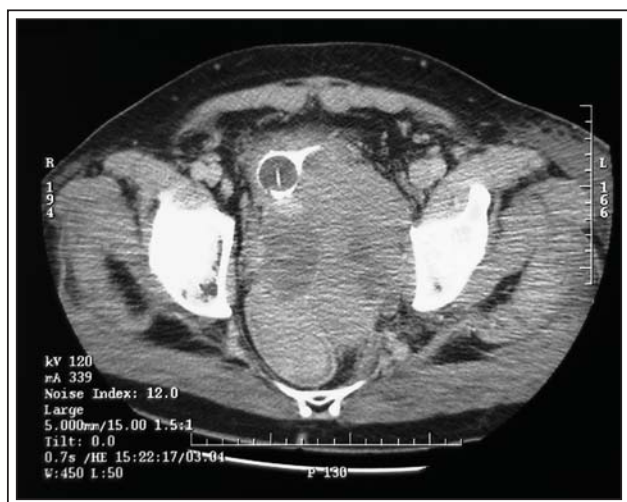
Figure 1. Case 2 CT scan of the pelvis. A 9 cm heterogenous mass fills the pelvis, displaces and compresses the bladder anteriorly and to the right and displaces the rectum posteriorly and to the right.

All pathological samples were fixed in 10% buffered formalin, embedded in paraffin, and stained with hematoxylin and eosin. The histological features of the tumor present in the prostatic needle biopsy in Case 1, as well as the rectal and prostatic wedge biopsies in Case 2, were very similar. The tumor in all samples consisted of a cellular proliferation of spindle cells with centrally located, oval, hyperchromatic nuclei with inconspicuous nucleoli, and variably abundant pale staining cytoplasm without distinct cytoplasmic borders. In Case 1, the tumor showed marked increased cellularity, a storiform pattern, abundant mitotic figures and only mild cytologic atypia. The tumor cells were arranged in well formed fascicles with focal areas of nuclear palisading, Figure 2a. In comparison, the tumor in Case 2 was not